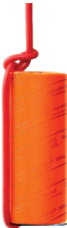
Figure 02 Detonating Cord attachment

Ensure the Booster is securely attached to the detonating cord by passing the cord down through on tunnel having a straight wall. Then bring this cord to the exterior of booster wall to form a loop and then tie the cord, as shown in figure 02 and then lower the complete assembly to the desired location in the blasthole. Never use detonating cord with coreload at 5 g/m for single pass threading. Cut the detonating cord downline from its reel and adequately secure it at the blasthole collar. Charge the hole with explosives to the design level. For any subsequently boosters on the same downline, unfasten the detonating cord tail and thread the end of the cord through the straight walled tunnel. Resecure the cord tail, at the collar and slide or lower the booster to the desired location.